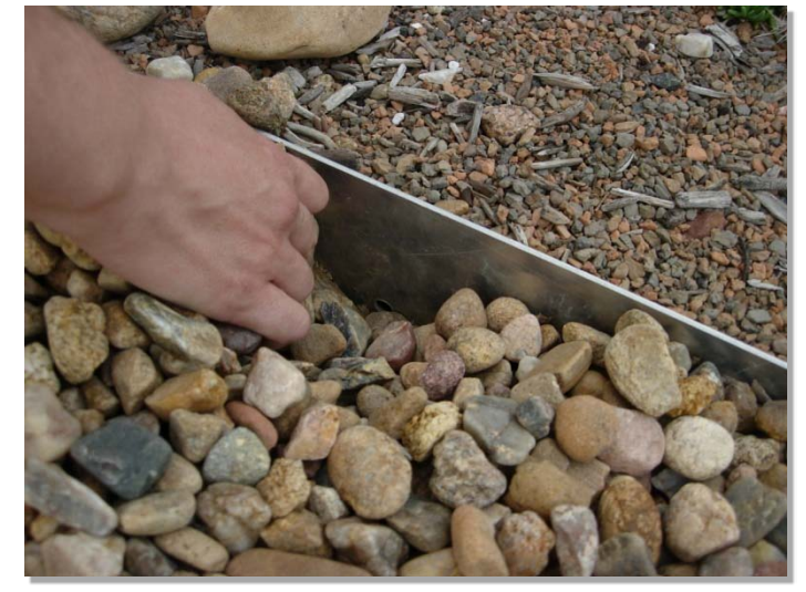
Photograph GR-2 . The metal edge shown in Photo GR-2 has perforations near the bottom to allow flow into the drain.

Roof outlets, interior gutters, and emergency overflows should be kept free from obstruction by either providing a drainage barrier (e.g., a gravel barrier between the green roof and the emergency overflows) or they should be equipped with an inspection shaft. A drainage barrier should also be used at the roof border with the parapet wall and for any joints where the roof is penetrated, or joins with vertical structures.