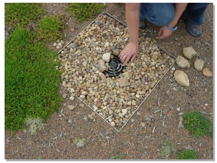
Photograph GR-3 . Metal edging separates growing media from rock that surrounds the roof drain. It also serves to facilitate regular maintenance by limiting plant and root growth near the drain.

5. Growing Medium : Growing medium is a key issue with regard to plant health, irrigation needs, and potential stormwater benefits. The growing medium is not the same thing as "soil." Most extensive green roof substrate is predominantly made up of expanded slate, expanded shale, expanded clay, or another lightweight aggregate such as pumice. However, such lightweight aggregates have some limitations. These materials typically drain very quickly and leave little water or nutrients available to plants. Therefore, additional research is necessary on substrate mixes appropriate for use on extensive green roofs in Colorado. For intensive green roof applications where weight is explicitly factored into the structural design, the soil matrix can include materials with higher water retention characteristics such as organic matter (e.g., compost), provided the structural design accounts for the saturated load.