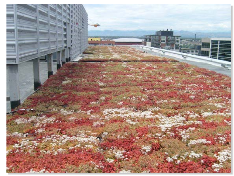
Photograph GR-1 . EPA Region 8 building in downtown Denver.

There are two main types of green roofs: extensive and intensive. Extensive green roofs are shallow, usually with 4 inches of substrate, and do not typically support a large diversity of plant species because of root zone limitations. Intensive green roofs are more like rooftop gardens with deep substrate (from 4 inches to several feet) and a wide variety of plants. Most