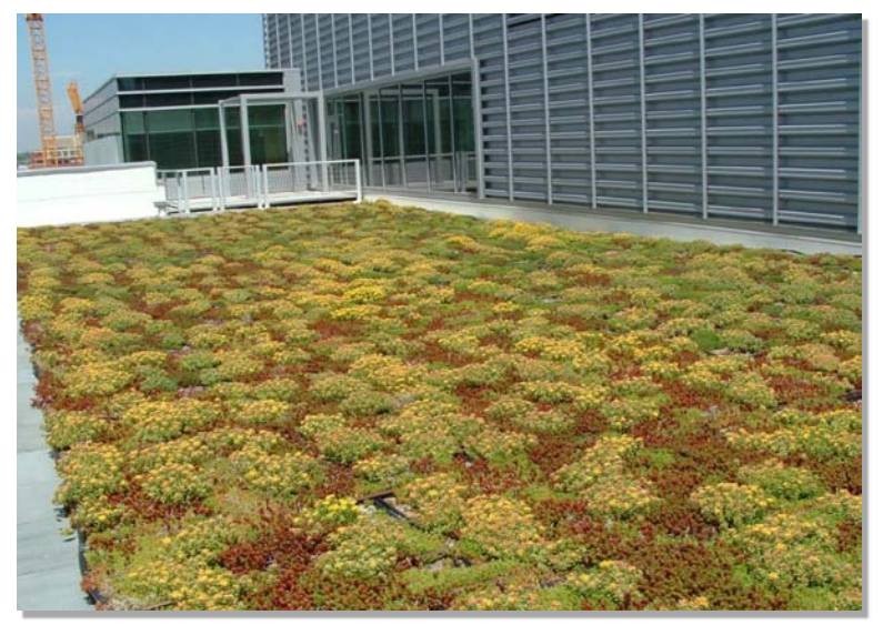
Photograph GR- 4: A modular, extensive green roof in the spring on the Environmental Protection Agency Region 8 Headquarters in downtown Denver.

The roof is fitted with both drip and spray irrigation. Four irrigation zones are monitored and adjusted according to weather and temperature. All green roof irrigation is recorded and stored in a central database.