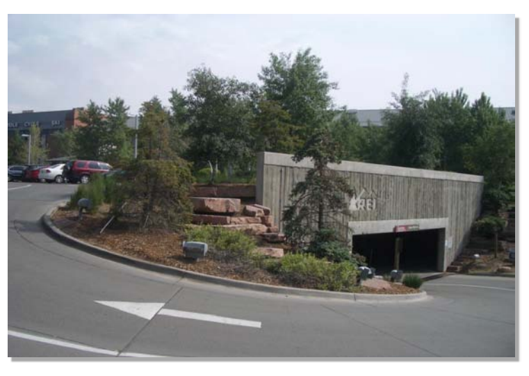
Photograph GR-6 . Intensive green roof installation above a parking garage.

• Residential Applications: There are numerous residential applications in Colorado; however, information on the design, vegetation, and performance has not been compiled.