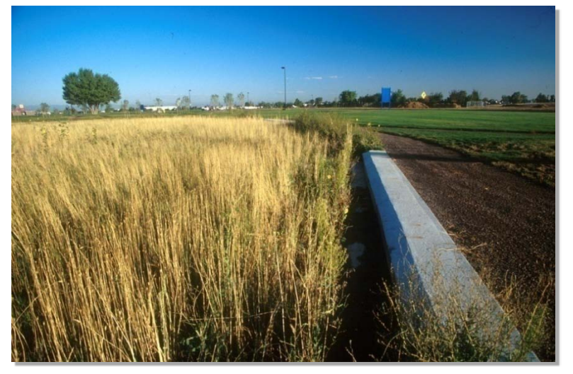
Photograph GB-2. This level spreader carries concentrated flows into a slotted pipe encased in concrete to distribute flows evenly to the grass buffer shown left in the photo.