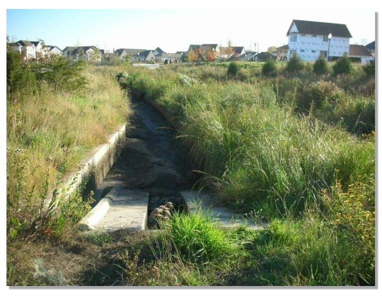
Photograph GB-4. Maintenance access is provided via the ramp located at the end of the basin.