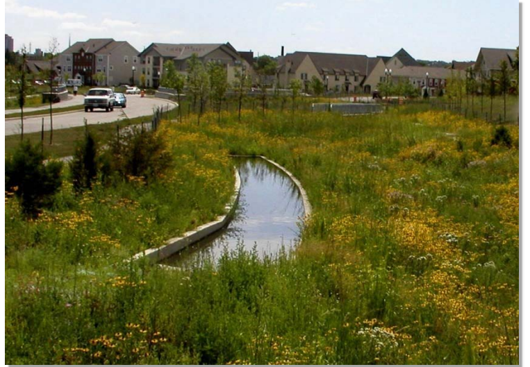
Photograph GB-3. This level spreader includes the added benefit of a sedimentation basin prior to even distribution of concentrated flows from the roadway into the grass buffer.

component for treatment within a grass buffer. Select durable, dense, and drought tolerant grasses to vegetate the buffer. Also consider the size of the watershed as larger watersheds will experience more frequent flows. The goal is to provide a dense mat of vegetative cover. Grass buffer performance falls off rapidly as the vegetation coverage declines below 80% (Barrett et al.2004).