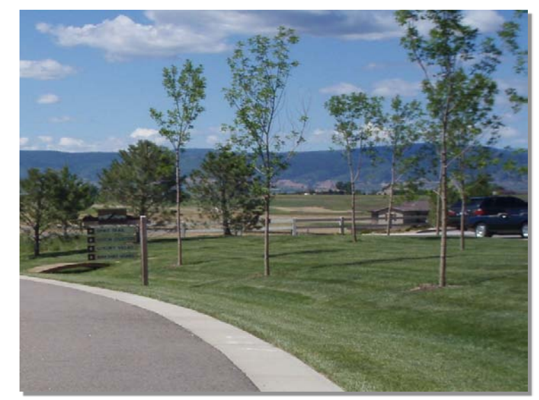
Photograph GB-1. A flush curb allows roadway runoff to sheet flow through the grass buffer. Flows are then further treated by the grass swale.

Grass buffers can be incorporated into a wide range of development settings. Runoff can be directly accepted from a parking lot, roadway, or the roof of a