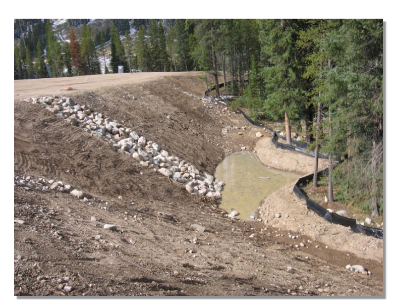
Photograph SB-1. Sediment basin at the toe of a slope.

Most large construction sites (typically greater than 2 acres) will require one or more sediment basins for effective